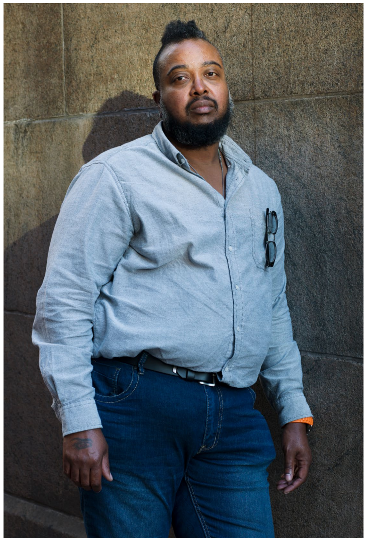
■ Preston, 52, East Haven, Connecticut, 2016

If an older adult trans veteran isn't connected with their local VA, an ally can research whether that VA offers trans-specific services.