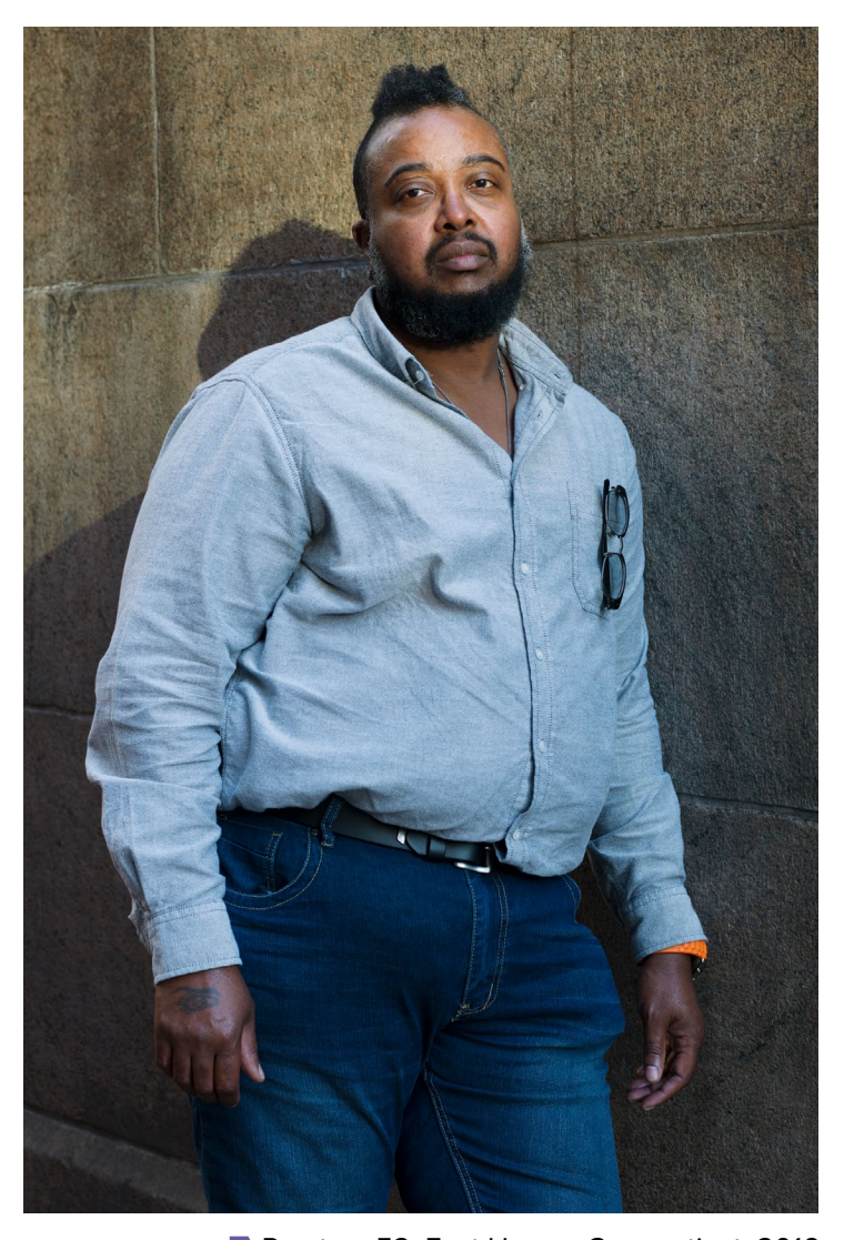
Preston, 52, East Haven, Connecticut, 2016

If an older adult trans veteran isn't connected with their local VA, an ally can research whether that VA offers trans-specific services.